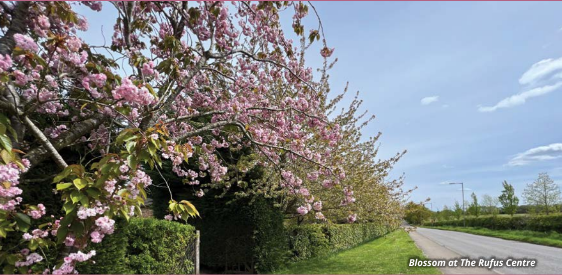
Blossom at The Rufus Centre