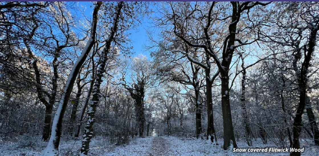
Snow covered Flitwick Wood