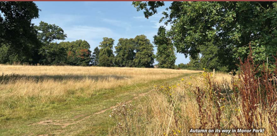
Autumn on its way in Manor Park!